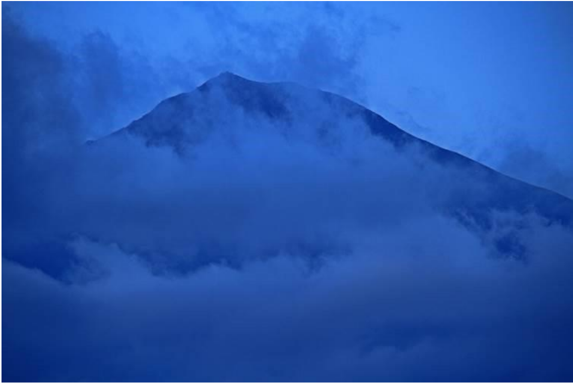
8.11 18 : 32