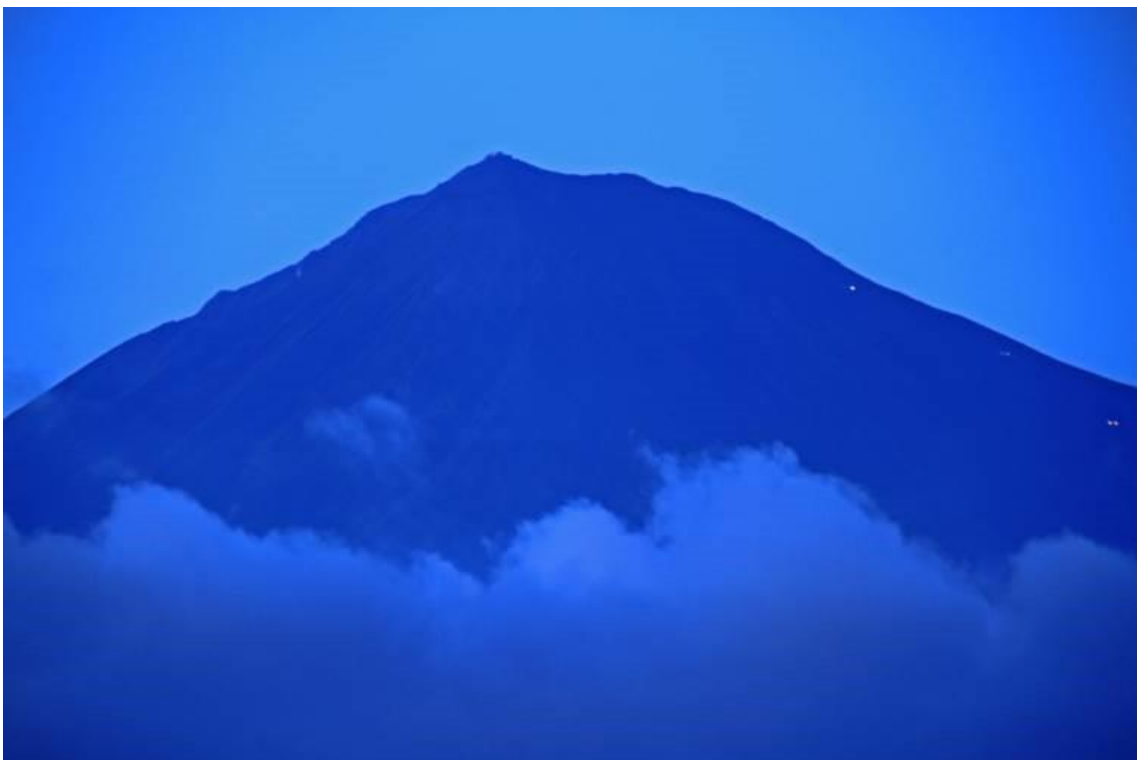
8.11 18 : 52